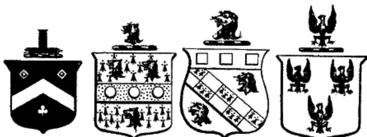
No. 4. Trail.

We propose to give a detail of those in the King's Chapel yard. Beginning in the northeast corner, next to the Massachusetts Historical Society's building, we find four flat stones next to the fence. These are as follows :